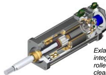
Exlar's GSX Series actuator integrates a servo motor and roller screw for a robust, clean and efficient electric solution.