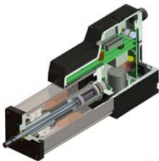
Tritex II linear actuator with embedded servo electronics (shown left) can solve your application with one integrated device.

With solutions that offer all of the power and control electronics as an integral part of the drive motor or actuator, Exlar is the perfect source for all the electric solutions needed to produce scissors lifts for today's energy and environmentally conscious market.