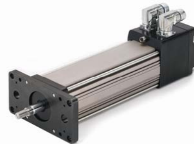
Tritex Series Actuator combining servo motor, linear actuator, position controller and servo drive.