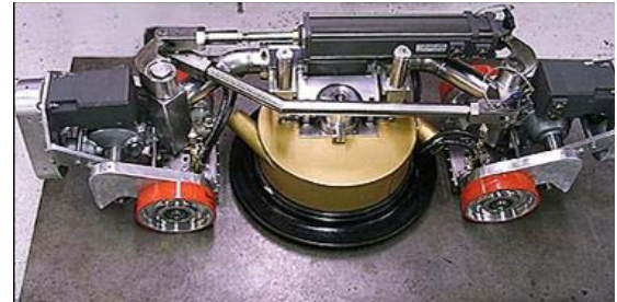
Robotic High Pressure Hydro Stripping System