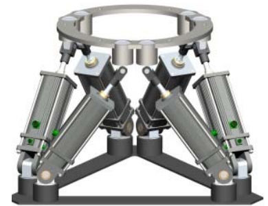
Six Degree of Freedom Motion Simulator

The combination of superior technology and expert design provides you with benefits that cannot be attained with other actuation methods.