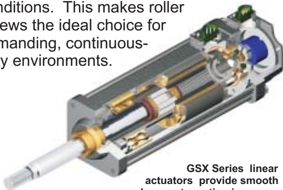
GSX Series linear actuators provide smooth and accurate motion in a compact, completely sealed package.

Exlar actuators differ from other actuators on the market with the use of a high performance satellite planetary roller screw. Fully utilizing the physics of power and motion, roller screws are unmatched at converting rotary torque into linear motion. Unlike acme or ball screws, roller screws are capable of carrying heavy loads, allowing rotational speeds in excess of 5000 rpm for thousands of hours in the most arduous conditions. This makes roller screws the ideal choice for demanding, continuous-duty environments.