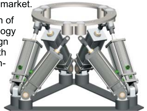
Six-degree-of-freedom motion simulator

The combination of superior technology and expert design provides you with benefits that cannot be attained with other actuation methods.