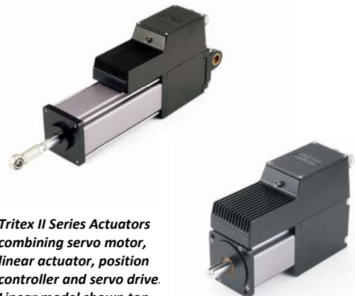
Tritex II Series Actuators combining servo motor, linear actuator, position controller and servo drive. Linear model shown top and rotary shown right.

Call us today at 952-368-3434 to learn of ways to optimize your application. Visit us at www.exlar.com for complete product information on all of Exlar's electric actuation solutions. If you prefer, you may also email us at info@exlar.com . We look forward to providing a solution to your next application.